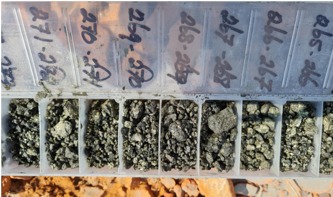
Figure 3. Photo of RC drill chips from NLDD044 showing intervals of semi massive copper sulphide mineralisation.