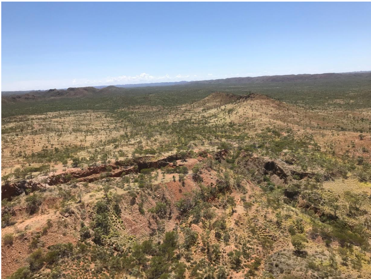
Figure 7. Mount Hope North open pit facing northeast.

The Mount Hope North open pit was developed on intersecting NS and ENE lines of lode that have been mined over a combined strike length of approximately 400m (Figure 7). The depth of the historical unengineered open pit varies from 5-10m to a maximum depth of approximately 30m (Figure 7). Widespread remnant secondary copper mineralisation is observable in the walls (Figure 8) and is presumably the lower grade copper mineralisation on the edges of the main mineralised zones which are obscured by rubble in the floor of the pits.