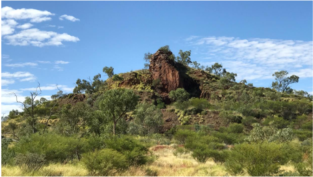
Figure 9. Binna Binna quartz reef facing southeast and showing shallow mined out areas at the base of the reef.