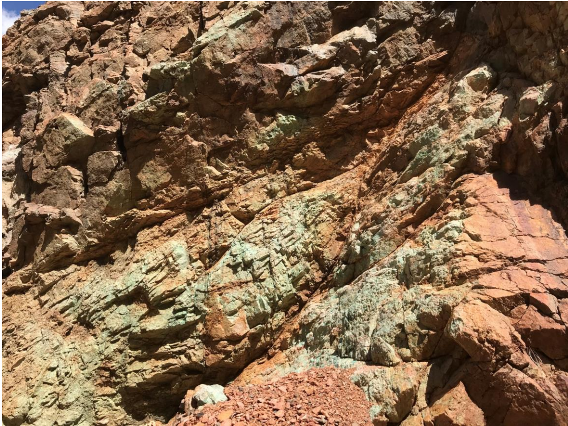
Figure 8. Mount Hope North open pit showing extensive remnant malachite copper mineralisation (Green mineral) in walls of the pit.