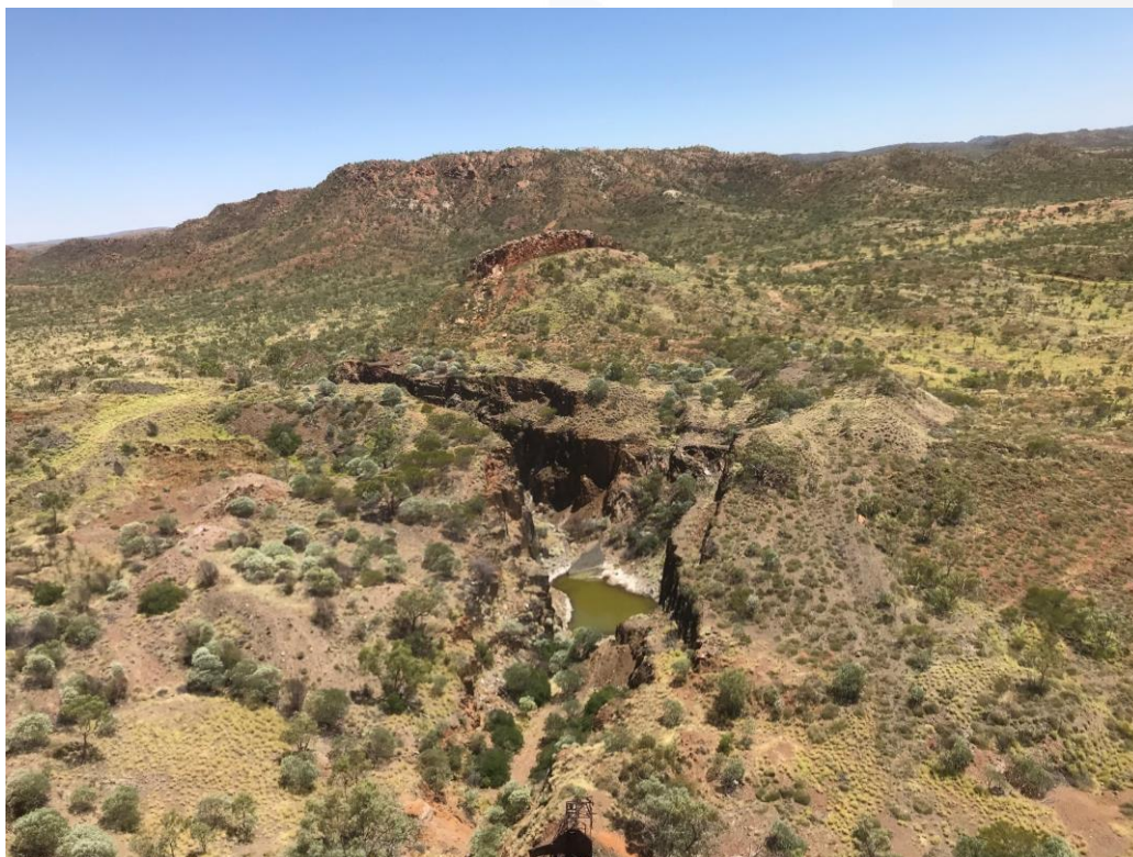
Figure 3. Mount Hope Main Pit looking west.

The Mount Hope Main open pit forms a similar geometry to the Mount Hope North Pit resulting in an arcuate style intersection of mineralised orientations that have been mined over a 300m strike length to depths varying from 5-10m to a maximum depth of approximately 40m (Figure 3). As occurs at the Mount Hope North pit, extensive secondary copper mineralisation is evident in the walls of the Mount Hope Main pit suggesting broad zones of copper gold mineralisation. Due to the steep pit walls the high grade core zones mined historically are almost entirely obscured by wall rock rubble that has covered the floors of the opens pits.