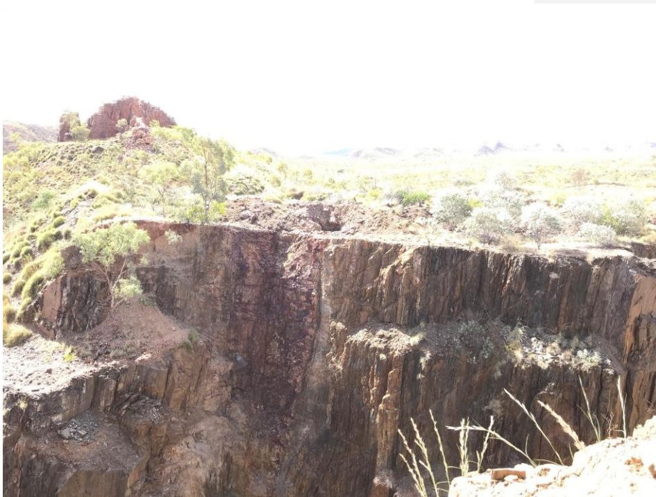
Figure 5. Southwest end of Mount Hope Main Pit, looking NNW and showing a large quartz iron copper zone extending into the pit wall, also mined in a shaft from the edge of the pit.