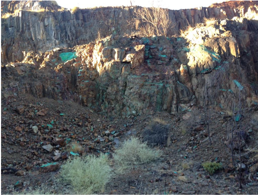
Figure 4. Mount Hope Main Pit showing extensive malachite copper mineralisation (green mineral) in the walls of the shallow pit.